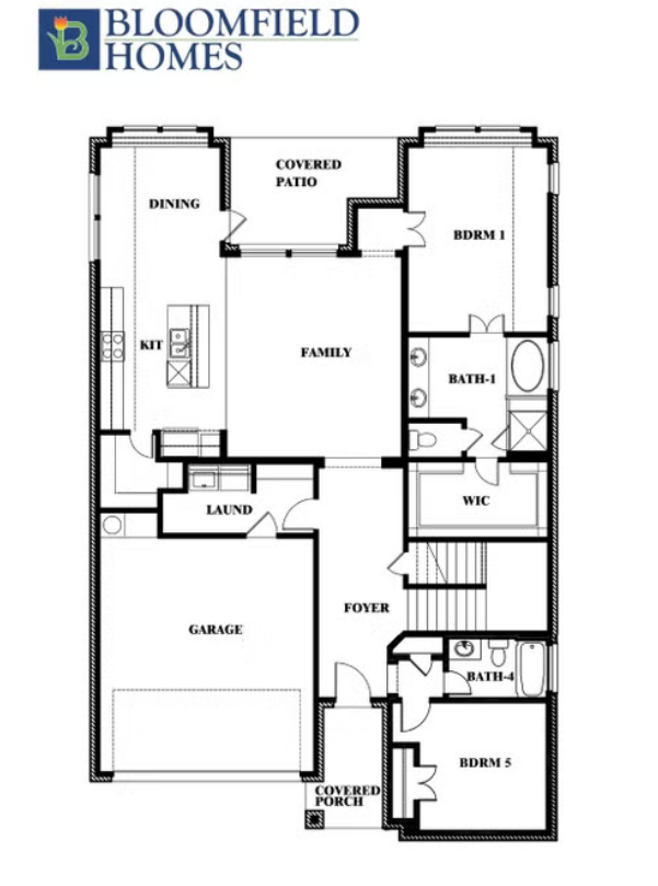
Violet IV Opt. Bed 5 & Bath 4 at Study

STAR RANCH 1012 BRENHAM DRIVE, GODLEY, TX 76044